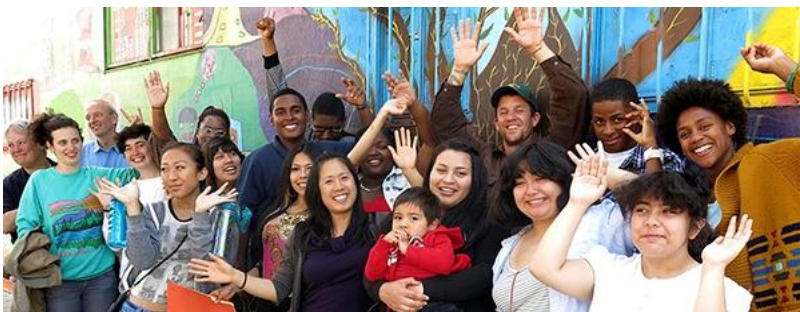
BEETS Summer 2013 Graduation